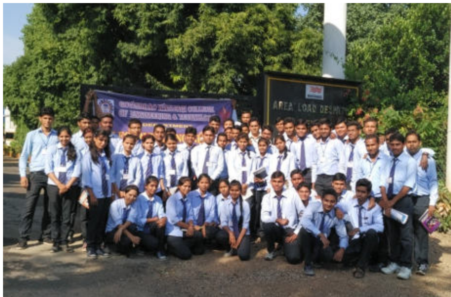
Industrial Visit to Khaperkheda Thermal Power Station